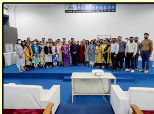
EBES FDP December 2021